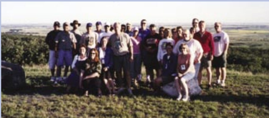
The "Mighty Mouse" Institute participants and instructors.